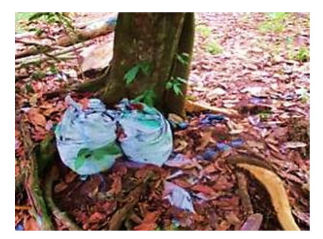
Figure 1. Root bark of D. kutejensis

The root bark of D. kutejensis was collected from Pulang Pisau, Central Kalimantan, as shown in Figure 1 . The plant sample was determined at the Laboratory of Biology Department, Universitas Negeri Sebelas Maret (No. 209/UN27.9.6.4/Lab/2017). The root bark was cleaned, chopped, dried in sunlight, and powdered. Root bark (5 kg) was extracted with ethanol 96% for three days by the maceration method. The filtrate was filtered and evaporated with a rotary evaporator at 50°C.